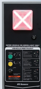
Narrow 9.5" x 21" Heavy-Duty Industrial Control Box