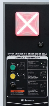
Narrow 9.5" x 21" Heavy Duty Industrial Control Box