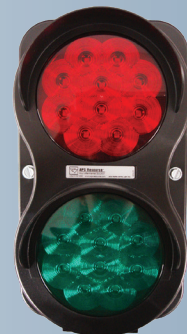
Universal Red and Green LED Lights