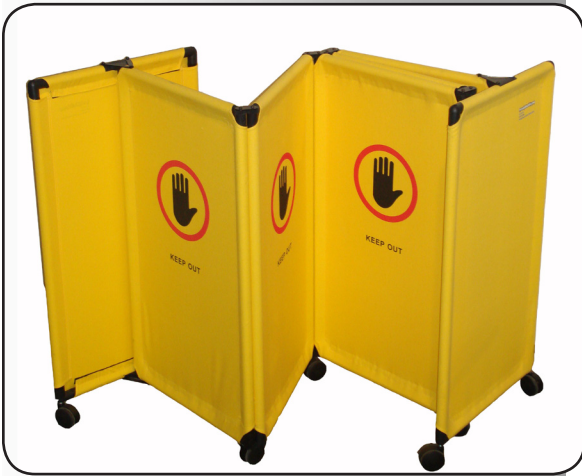
CVB-10: Fold Canvas Sections

Economical design enhances loading dock safety.