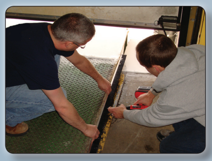
Dock Leveler Brush Seal

APS Dock and Door Weatherseal products can help pass inspections by regulatory authorities. APS products are designed to seal air gaps and control pest infestations.