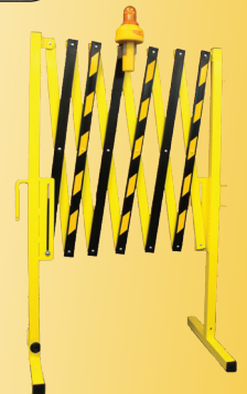
Steel Visual Barrier