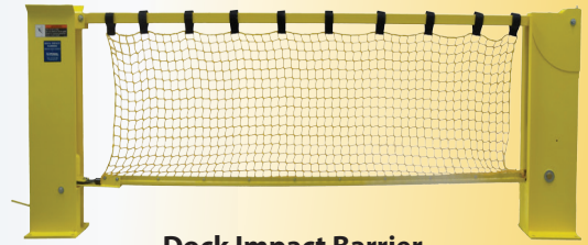
Dock Impact Barrier