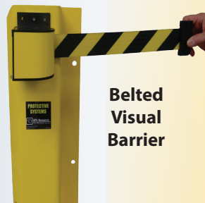
Belted Visual Barrier