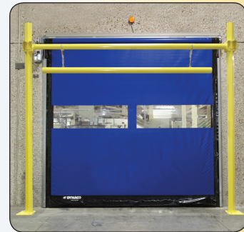
Wall & Door Guard