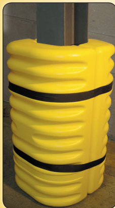
Poly-Barrel Column Protector