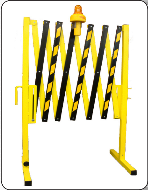
VB12-S: Expandable Steel Lattice Grill w/ Optional Strobe Light