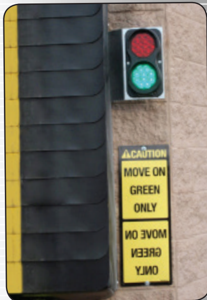
Outside Light Assembly