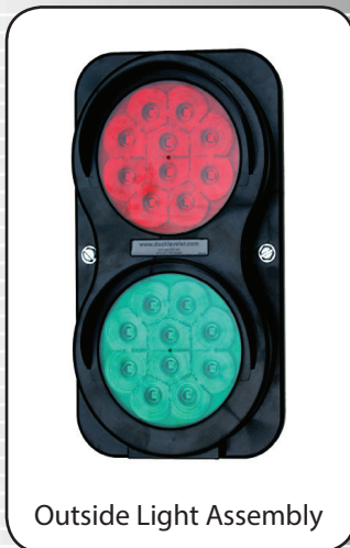
Outside Light Assembly

The APS&GO is an important communication tool for dock workers and truck drivers. It reduces the potential for serious accidents from truck drivers pulling away before loading/unloading is finished.