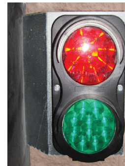
Outside Assembly with Optional AP3921 Bracket