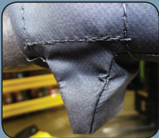
Figure 2: Triangular design for best fit

The Door Sprag fills gaps between the dock leveler and the pit wall. It's compatible with most door styles and is constructed of a hypalon material. With the inclusion of door sprags, your loading dock is given bolstered sealing qualities.