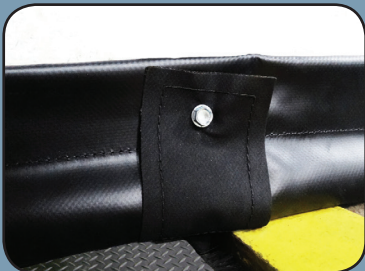
Figure 3: Door Sprag attachment and pit gap fill