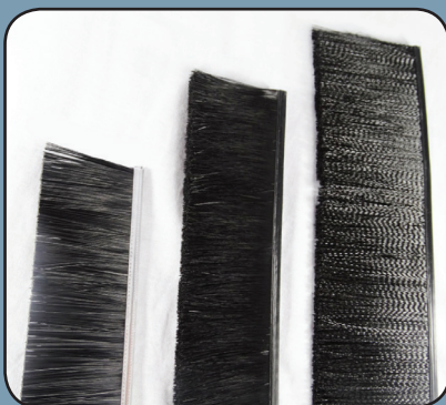
Figure 3: Brush sizes from left to right: 1.5", 2" and 3"

Door Weatherseal is a reliable product aimed at bolstering your door's energy saving initiatives. To maximize your efforts, Weatherseal is able to be used on all sides of the door. And in order to accommodate certain requirements, there are numerous retainer angle options.