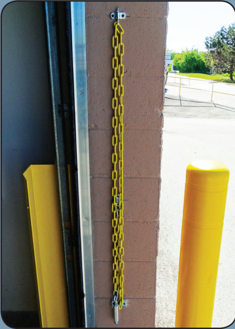
Figure 1: Dual Chain suspended from J-Bolt

The Dual Chain is a set of strengthened security chains used to help protect workers from edge of dock accidents. This protective product is anchored into the door frame, stretches across the dock and secured in corresponding receivers. The Dual Chain is a cost effective, easily installed barrier option.