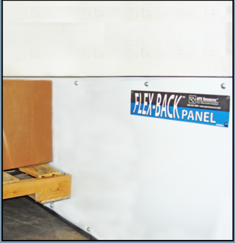
Figure 1: The FLEX-BACK Panel can be installed as a bottom and an intermediate panel

The FLEX-BACK Panel reduces costly door damage costs with its flexible fiberglass frame and high impact polymer skin. The insulated panel also acts as an additional energy cost saver.