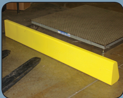
Figure 3: 60" Fork Sentry positioned in warehouse