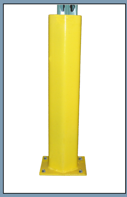
Figure 1: Post Protector