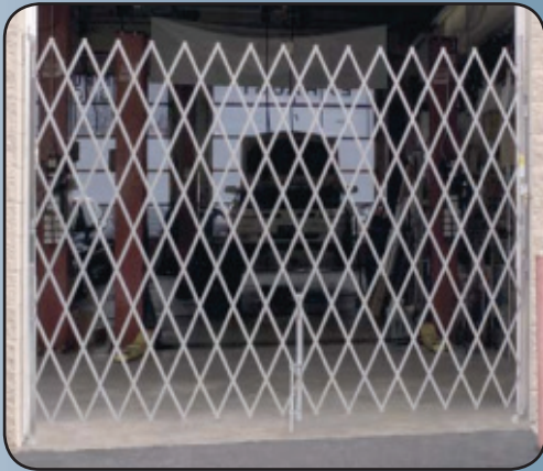
Figure 1: Single Slide Security Gate

Security Gates are cost-friendly products that primarily focus on access control but stresses visibility and enhanced air circulation as well. They are designed to secure receiving doors, doorways, service doors and hall and entrance ways.