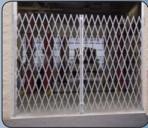
Figure 2: Bi-Part Security Gate

Security Gates are cost-friendly products that primarily focus on access control but stresses visibility and enhanced air circulation as well. They are designed to secure receiving doors, doorways, service doors and hall and entrance ways.